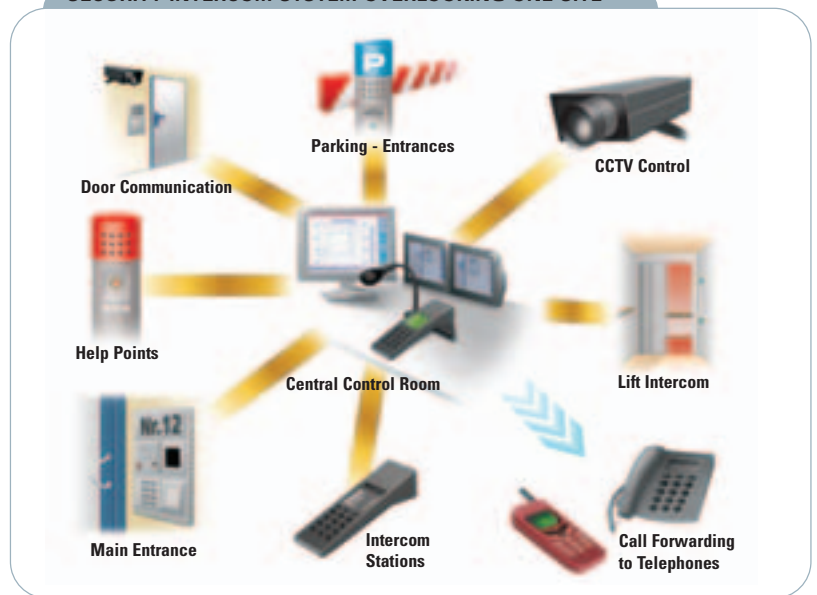
SECURITY INTERCOM SYSTEM OVERLOOKING ONE SITE